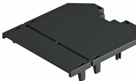
Plate can be reduced to 61 mm as required.

Cover plate, blank, for closing off unused installation space of the UT3 universal support.