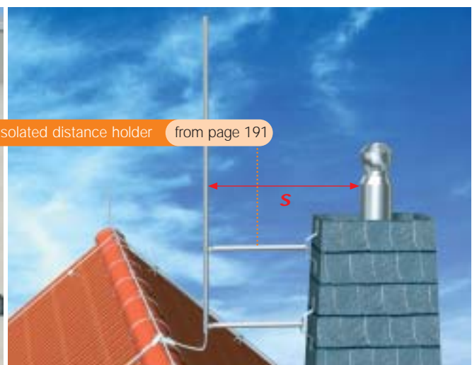
Correctly observed separating distance s between intercepting system and stainless steel chimney