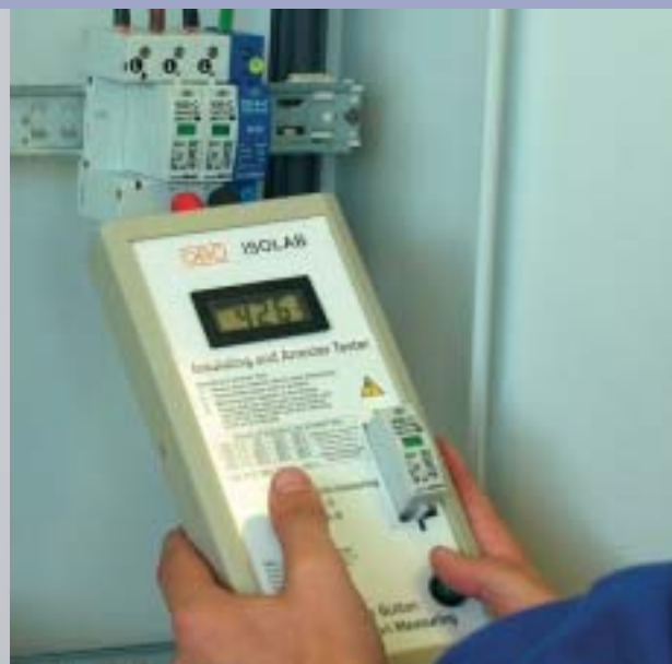
Measuring surge arresters