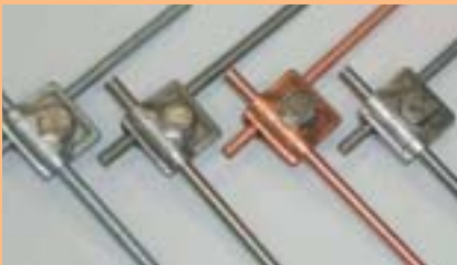
Materials: example of round conductor, 8 mm and vario rapid connector, type 249 in steel (FT), steel (VA), copper and aluminium.

The following materials are preferred for use in external lightning protection systems: hot-galvanised steel, stainless steel (VA), copper, aluminium.