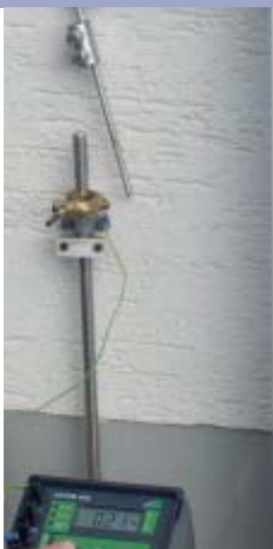
Measuring the earth resistance