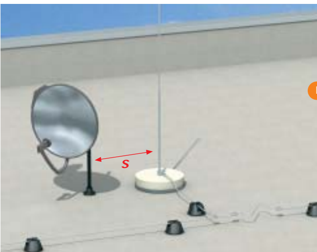
Correctly observed separating distance s between interception system and SAT system