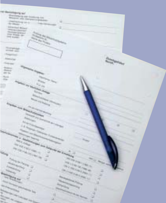
Time intervals between repeat tests